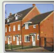
Flats to 3 bedroom houses